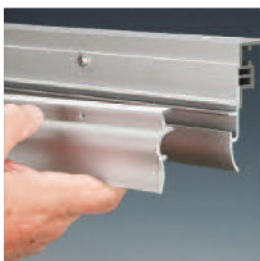
1. Mount the rear track.