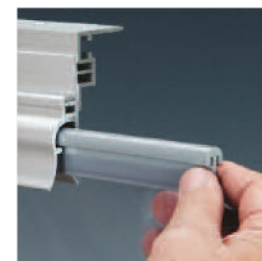
(Optional) Assemble the mounting first and then slide the curtains in.