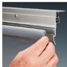
2. Hook curtains into place on the rear track.