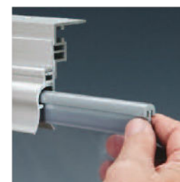
(Optional) Assemble the mounting first and then slide the curtains in.