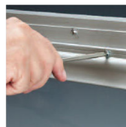
3. Screw-in the face plate. Overlaps are automatically and perfectly aligned.